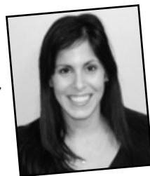
Teachers of Three year olds