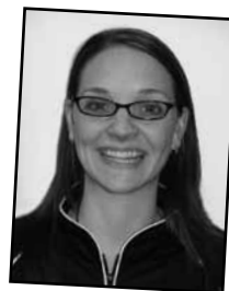
Teachers of Four year olds